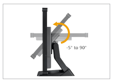
Wide range of tilt flexibility from -5^\circ to 90^\circ