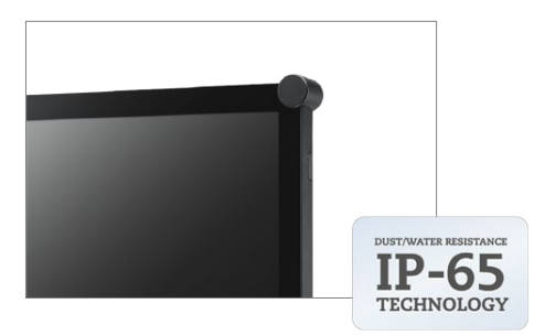
A rating of IP65 attests to its extraordinary protection against dust and liquid