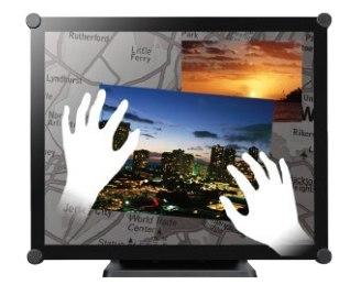
Integration of 10-point touch and projected capacitive touch technology provides accurate and precise touch experience