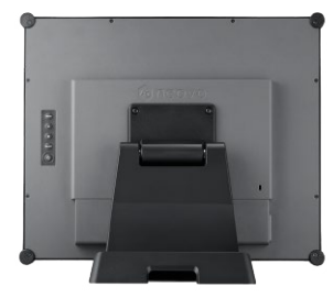
Durable metal housing and the whole enclosure designed with IPX1 level for drip-proof