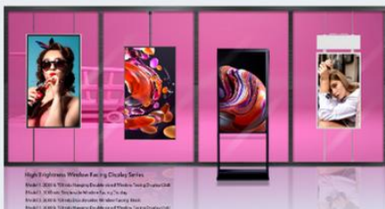
Window Facing Display Solutions