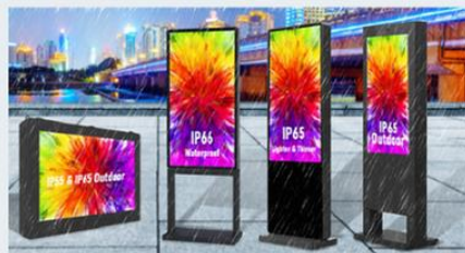
Outdoor Digital Singage Solutions