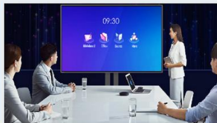
Interactive Whiteboard Solutions