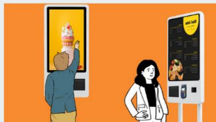
Self-service Payment Kiosk Solutions