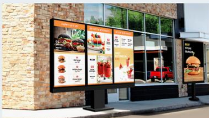
Outdoor Drive Thru Solutions