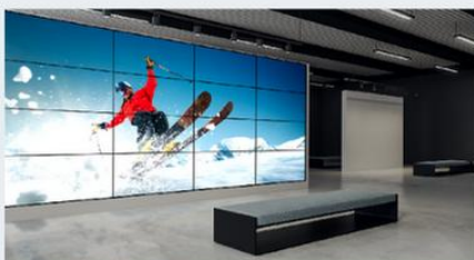
LCD Video Wall Solutions