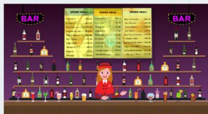
Digital Menu Board Solutions