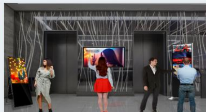
Indoor Digital Signage Solutions