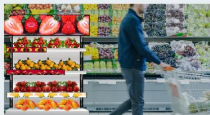
Shelf Edge Stretched Display Solutions