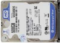
2.5" HDD 500G\ 1TB