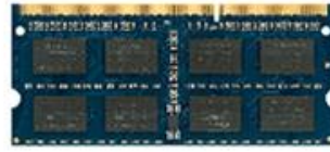
DDR3L RAM 2G\ 4G\ 8G