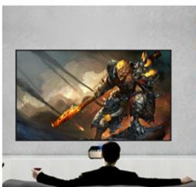
HD Video playback