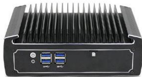
Without COM Ports